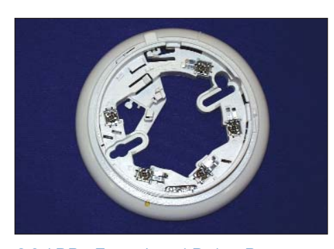
5BI 5" Isolator Base

With all the features of the 5B Universal Base the 5BI Isolator Base allows any or all 800 Series MX Detectors to be upgraded to incorporate