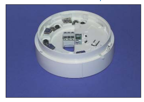
801RB - Functional Relay Base

The 801RB provides dual relay contacts for signalling external devices on MX addressable systems. A very low operating current even when the relay is energised enables the relay base to be used without any additional power. The dual contacts are under the control of a programmable output, through the powerful cause and effect software.