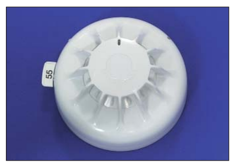
800I Ionisation Smoke Detectors

The 800H is a flexible cost-effective addressable heat detector with all the features of MX VIRTUAL detectors. The 800H returns the temperature to the MX detection panel which allows various detection modes to be implemented. The 800H uses a high quality thermistor with very low thermal mass. This allows the detectors to provide fast accurate