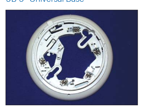
5B 5" Universal Base

This is the most common base designed to fix directly to the ceiling or various common backboxes. This base allows a detector to be plugged in directly or a functional base to be plugged in between the base and detector.